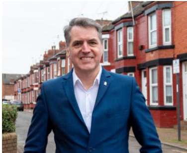
Steve Rotheram Mayor of the Liverpool City Region

Since 2014, Sefton has been part of the Liverpool City Region Combined Authority. But what does that actually mean for you and your family?