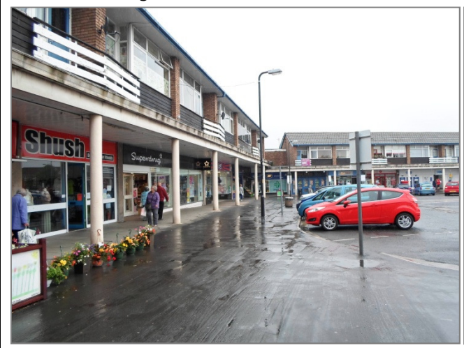
The Central Square Shopping Centre and car parking.

Vacancies within the centre represent 10.1% of units, slightly below the national average of 11.3% of units. In addition, the former Maghull Library building on Liverpool Road North is a prominent vacant unit, with the plot identified as for sale. A new library is now accommodated at the Meadows on Hall Lane, 0.5km to the south of the district centre. The former Stafford Moreton Youth Centre building on the neighbouring plot is also no longer in use. For consistency with previous health check surveys these two vacant buildings are not incorporated into the data provided in Table 1 as their previous use was not for commercial purposes. However, together these two neighbouring plots occupy a sizable area of presently underused land which is well connected to the primary activity of the district centre. The largest vacant unit within the centre is the former Red Lion Garage on Liverpool Road North at the northern extremity of the district centre.