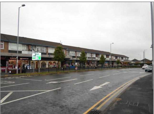
Shopping terrace, north side of Westway.