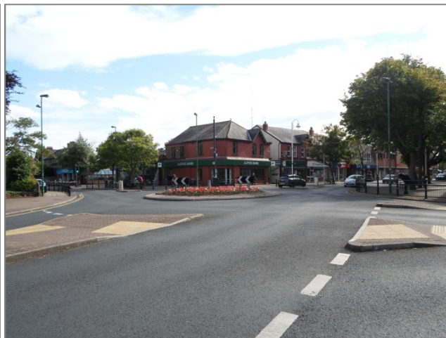
Roundabout at junction of Chapel Lane and Halsall Lane