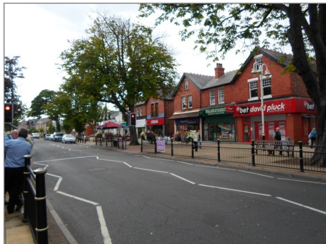
Retail units on Chapel Lane.