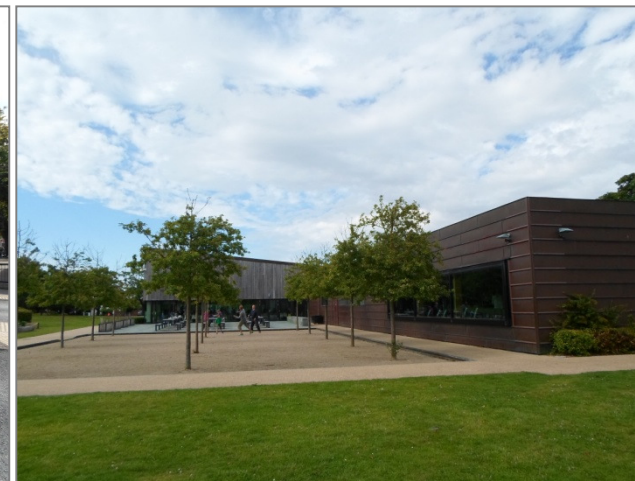
Open outdoor space at the rear of Formby Pool