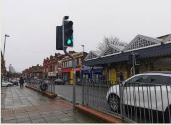
Figure 2: Waterloo Rail Station and the adjacent Home Bargains in March 2020.