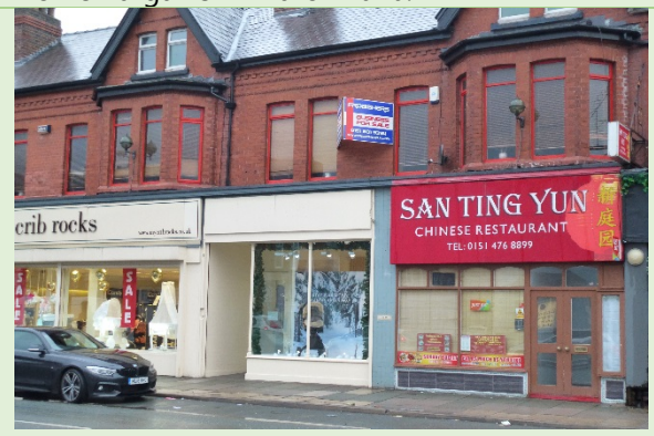
Figure 4: Retail units on Crosby Road North in January 2019