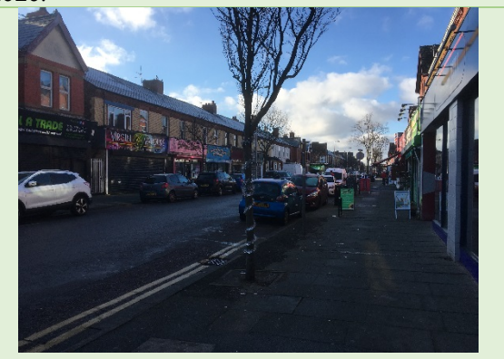
Figure 3: St John's Road, which runs through the north of Waterloo, in January 2019