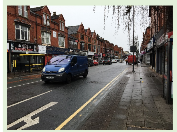
Figure 1: Retail units on South Road in March 2020.