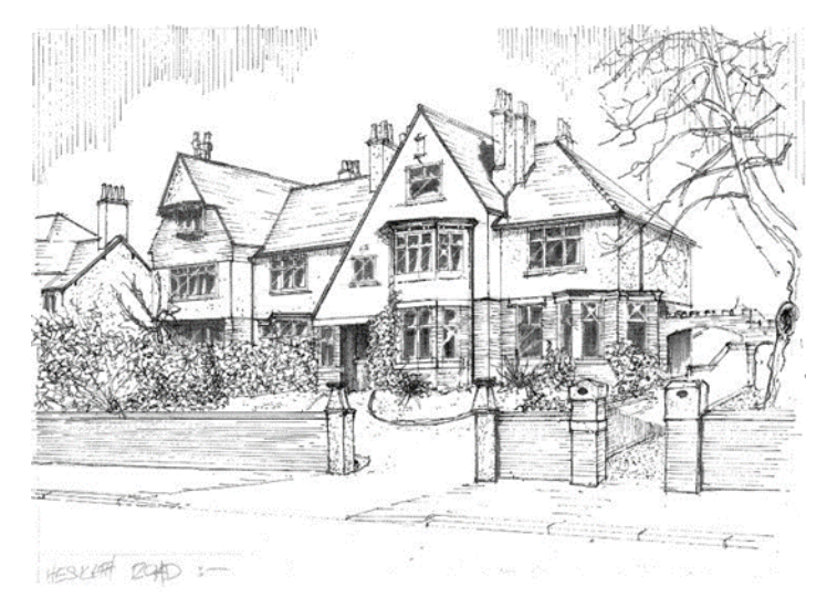
Drawing of Hesketh Road Conservation Area

Planning Services Sefton Council Magdalen House, 30 Trinity Road, Bootle. L20 3NJ