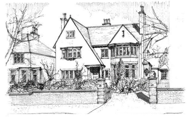
Drawing of a house inside Hesketh Road Conservation Area