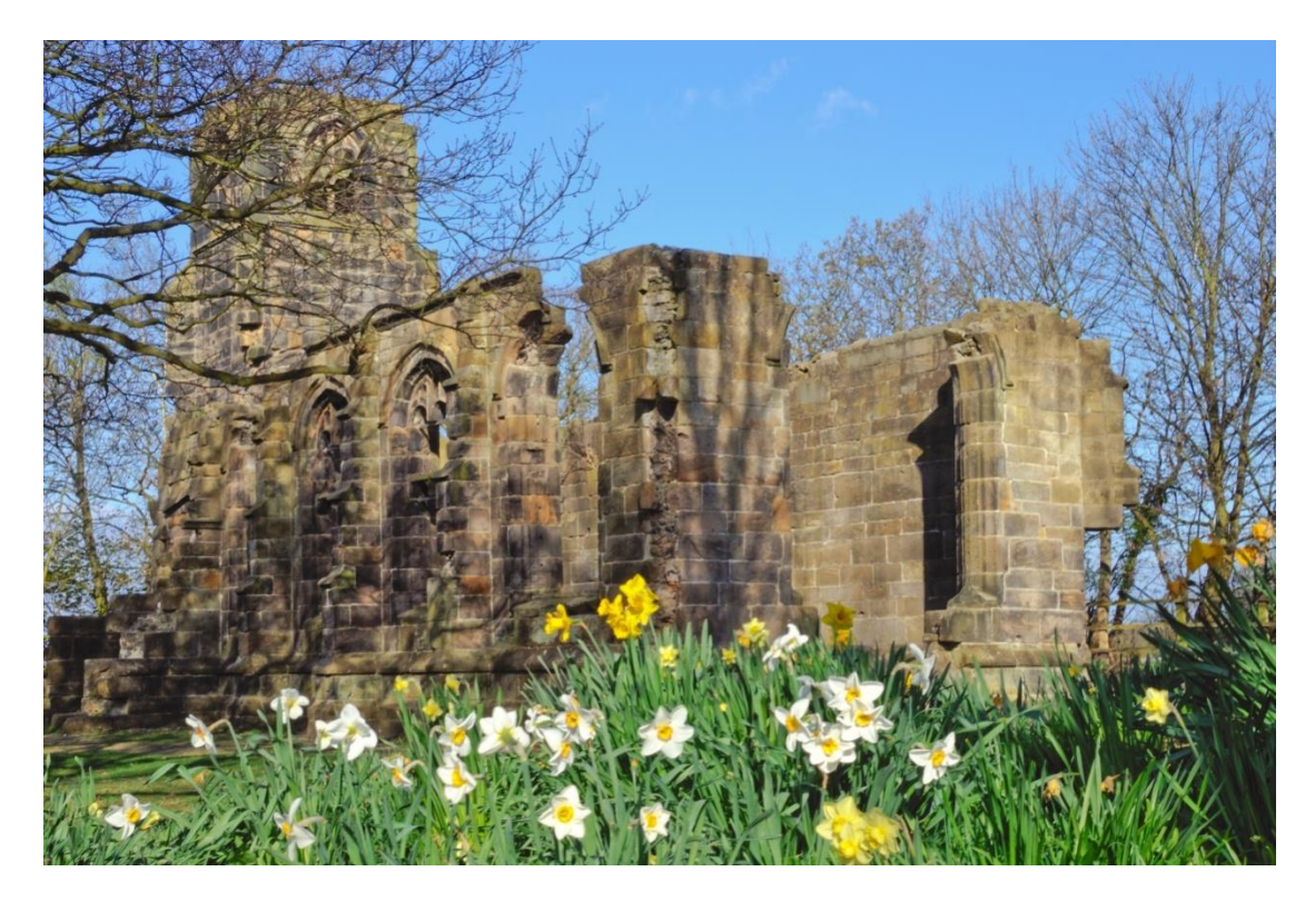
Basic Conditions Statement 19 April 2018