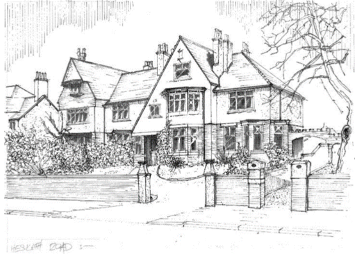
Drawing of Hesketh Road Conservation Area

Planning Services Sefton Council Magdalen House, 30 Trinity Road, Bootle. L20 3NJ