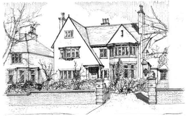
Drawing of a house inside Hesketh Road Conservation Area