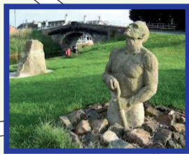
Halsall Navy Canal Workers' Monument