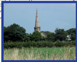
St Michael's Church