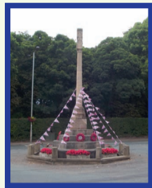
Halsall War Memorial

Start/Finish Town Green Railway Station, Aughton Distance 35 miles (Route can be split into stages) Terrain Variety of Road, Cycle Path and Towpath