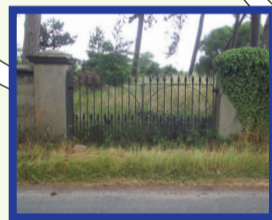
Friends' Burial Ground