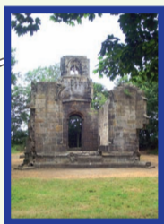
St Catherine's Chapel