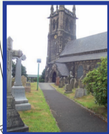
Christ Church Ormskirk