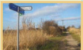
Trans Pennine Trail