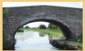
Melling Stone Bridge