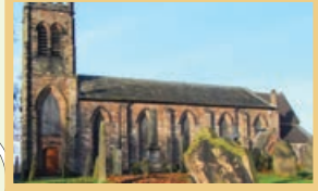
St. Thomas Church