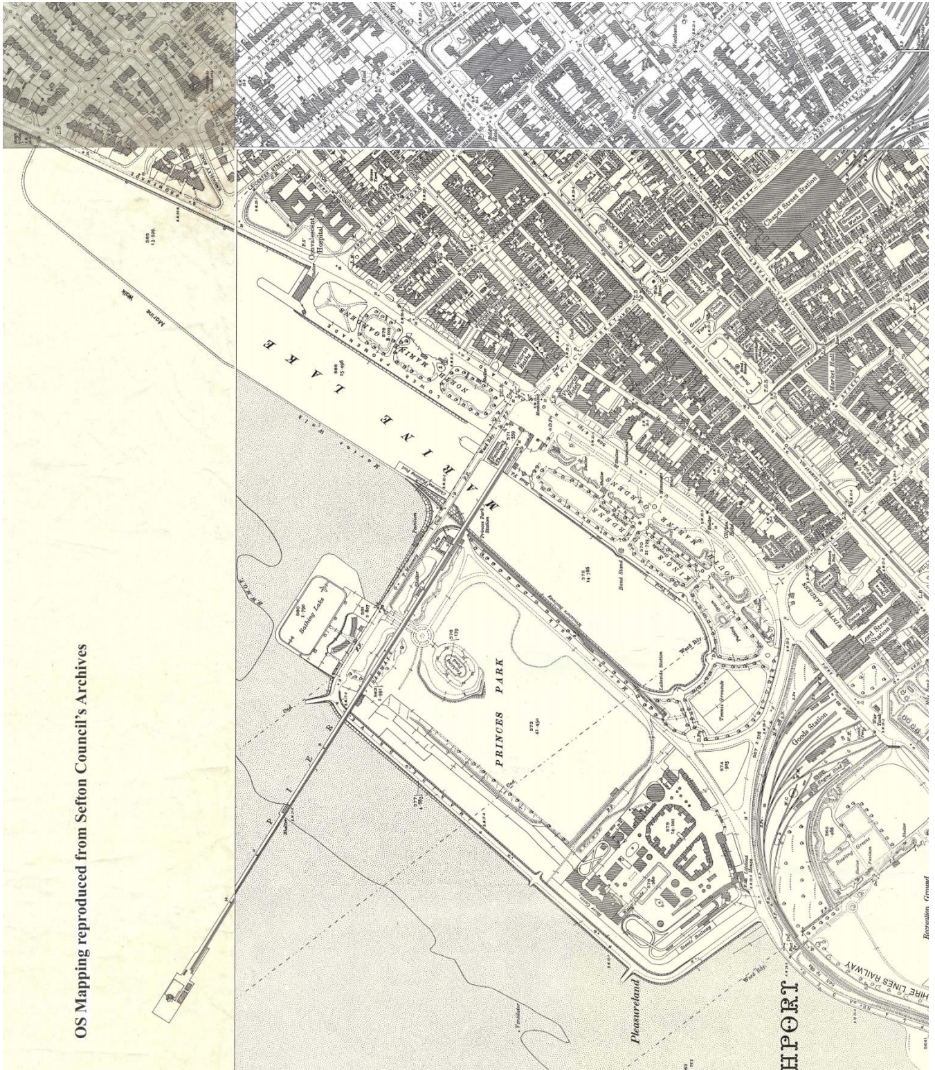
OS Mapping reproduced from Sefton Council's Archives