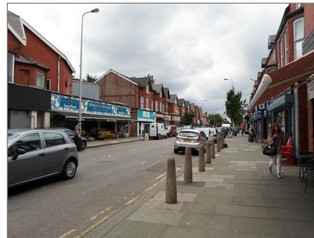
Primary Shopping Area on St John's Road.