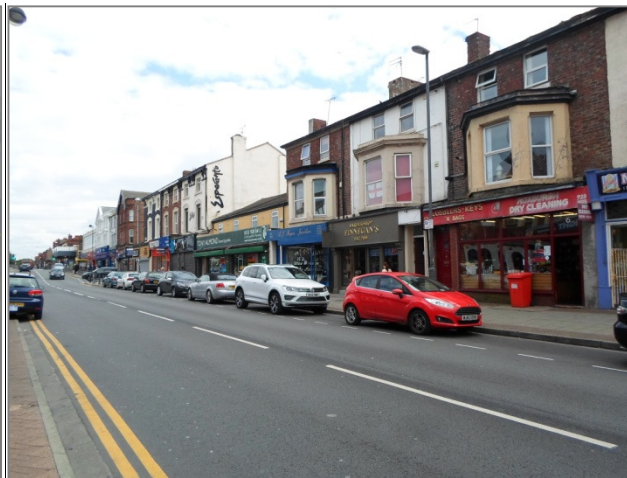
Retail units on South Road.