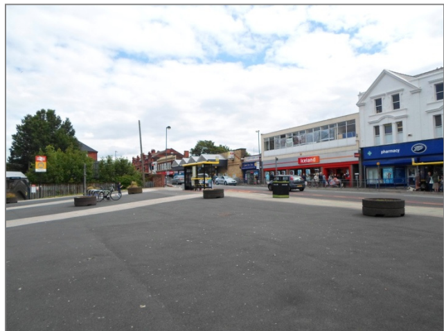
Waterloo Railway Station and shops on South Road.