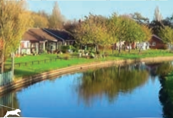
Leeds Liverpool Canal at Maghull