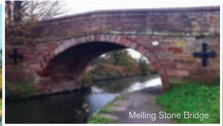
Melling Stone Bridge

If cycling, after crossing St. Michaels Road, then turn left, follow the road to the junction with St. Michaels Church and Stanley Arms pub. At the junction turn right into Church Lane. At the junctions fork left into Bold Lane. If walking turn right into St Michaels Road then first left into Smithy Lane. Continue along Smithy Lane then go straight on into Bold Lane, leading into the town centre of Aughton. Aughton is an historic Market town that has retained its rural charm. Follow Bold Lane and turn right at the junction of Town Green Lane and Middlewood Road, the railway station is on your right.