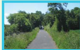
Path to Plex Moss Lane