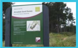
Ainsdale Sand Dunes