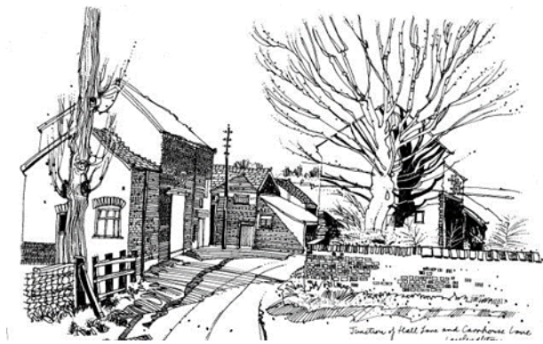
Drawing of Carr Houses Conservation Area

Planning Services Sefton Council Magdalen House, 30 Trinity Road, Bootle. L20 3N